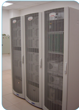
SysEng Database Server

Our Premier Service is designed to meet any stringent site-monitoring needs. This system is selected for several large scale LTA (Land & Transport Authority) projects in Singapore.